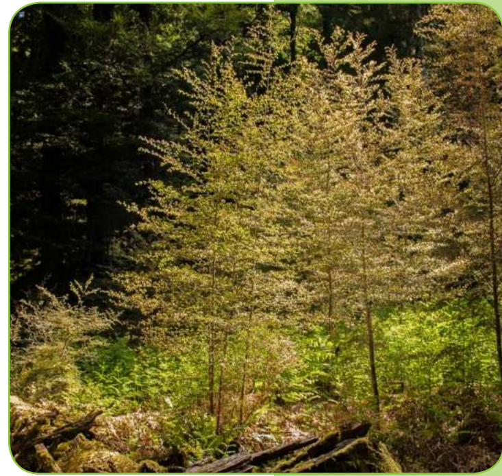
This leaflet provides a high-level overview of the New Zealand indigenous forestry management regime. To find out more about how New Zealand's forests are managed to enable sustainable forestry for future generations, go to: http://www.mpi.govt.nz/forestry/forestry-in-nz/indigenous-forestry.aspx